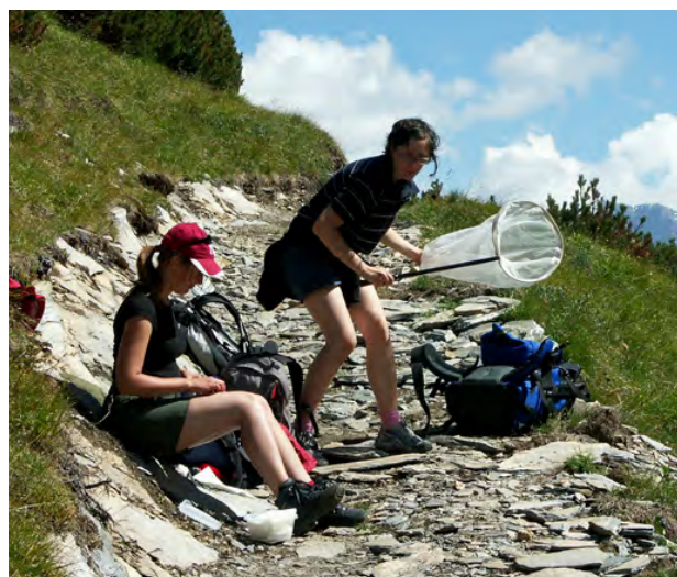
Hohe Tauern National Park (AU)

The Charter is normally awarded for a period of five years.