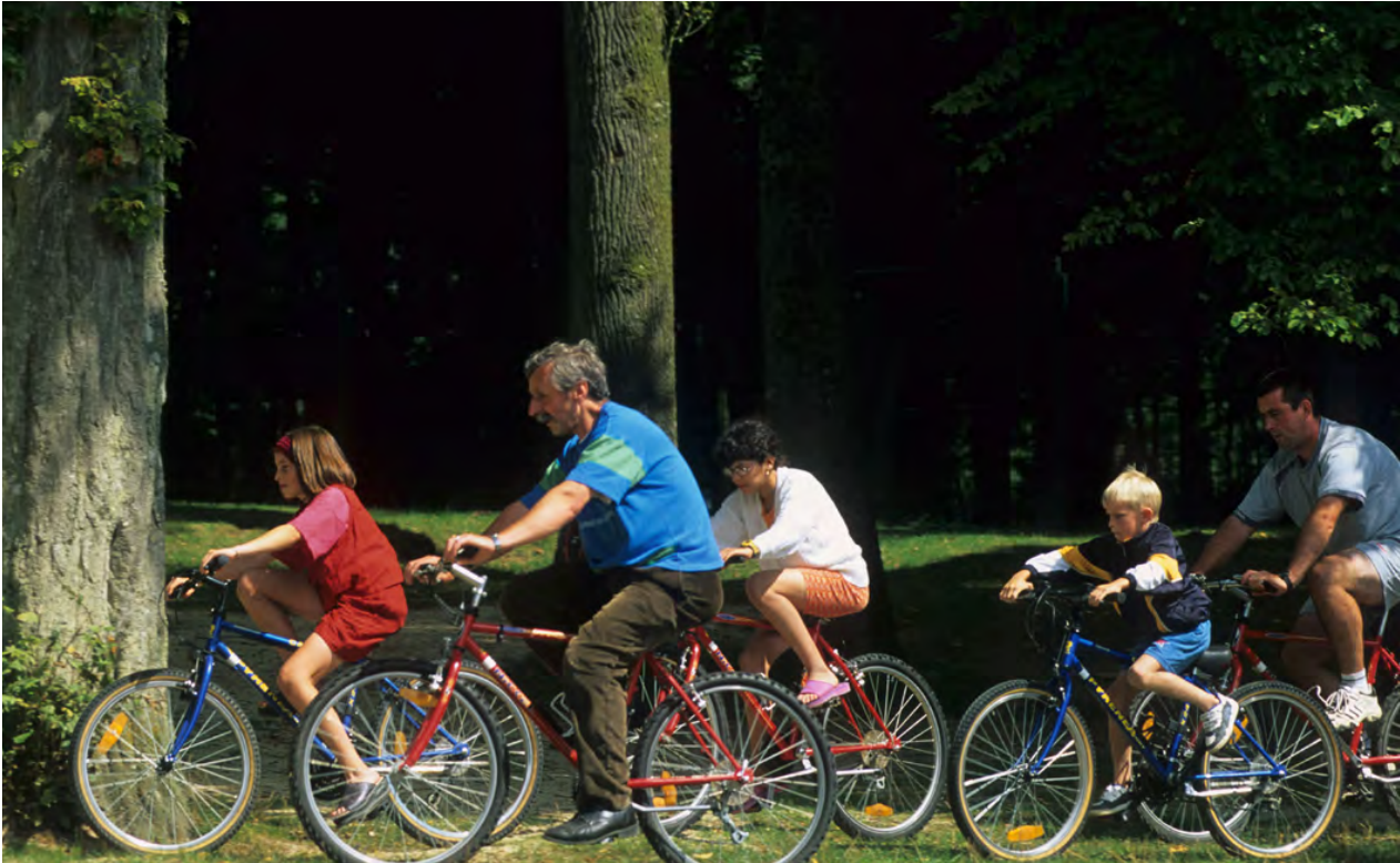
Avesnois National Park (FR) // Riding our principles