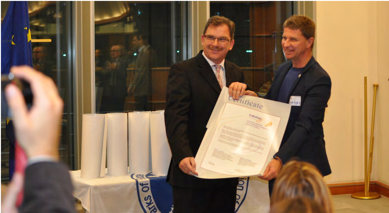
European Parliament, Brussels // Charter Award Ceremony 2014

To begin the verification process, the completed application (one set of documents) should be sent to EUROPARC Federation (only electronically, by e-mails, we Transfer or similar tools). The date of the current deadline should be checked with info@european-charter.org . Applications arriving after the official date cannot be considered until a later round of verifications.