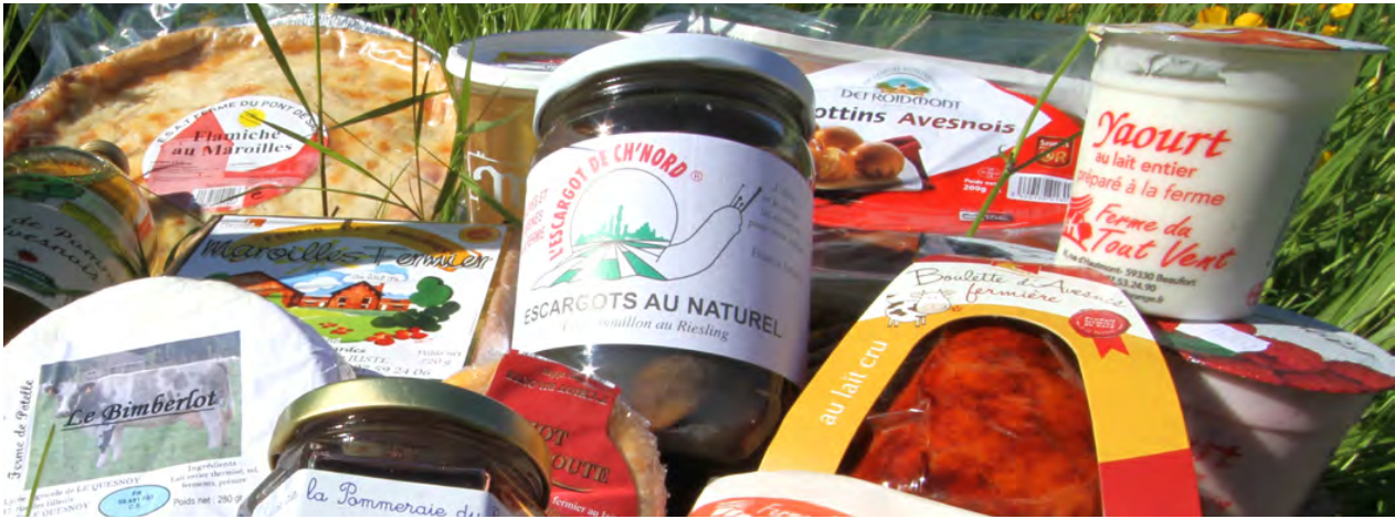
Avesnois National Park (FR) // Promoting local products