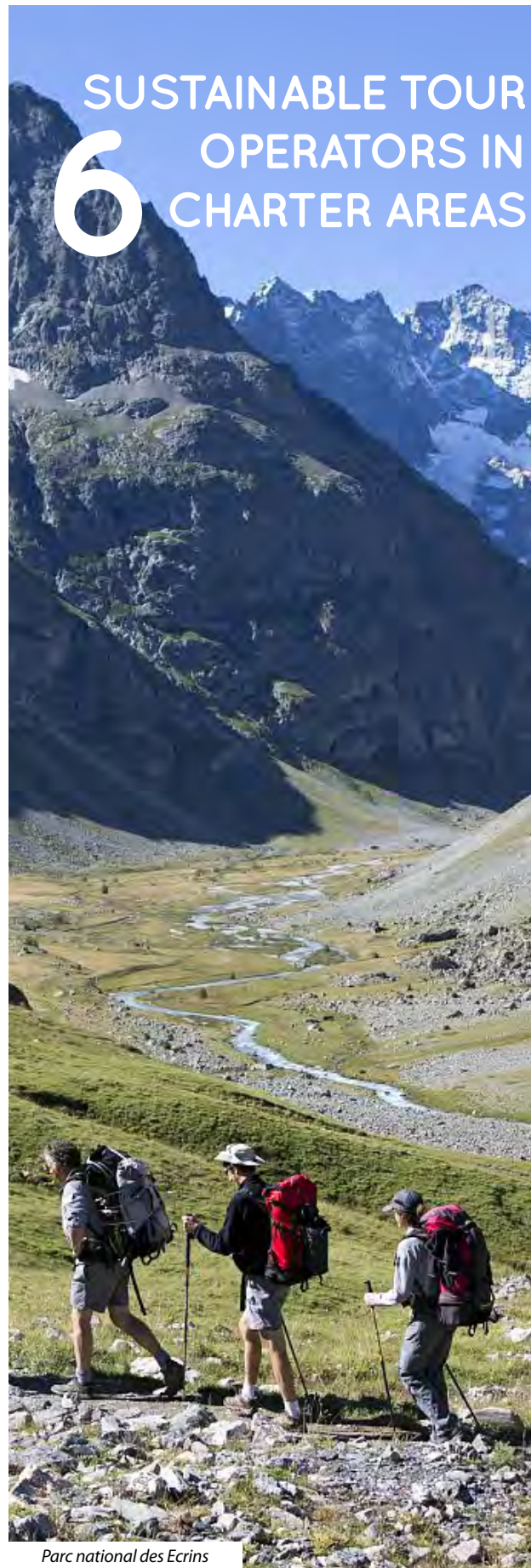
Parc national des Ecrins