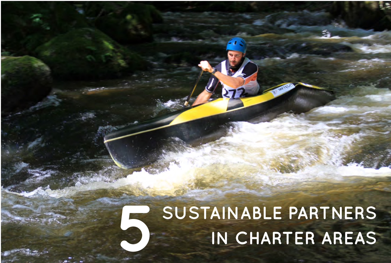
Parc National du Mercantour (FR) // Working with partners is an adventure

The engagement of local businesses is vital to the effective development and management of sustainable tourism. They must be represented on the sustainable tourism forum and be involved in the preparation and implementation of the sustainable tourism strategy and action plan.